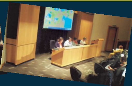
WOESA AGM held at the DBSA